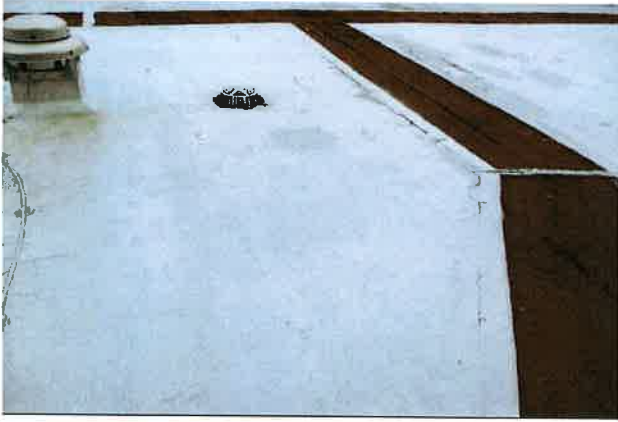
Roof coating in 2019